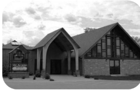
St. Agnes 210 Division Street, Walker