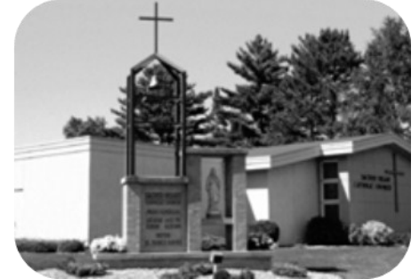
Sacred Heart 300 First Street North, Hackensack