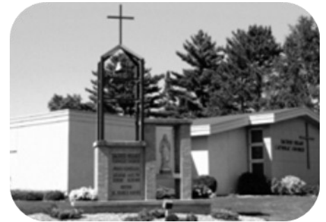
Sacred Heart, Hackensack 300 First Street North

Tuesdays at 8:30a to Wednesdays at 3:00p (except 1:00a to 5:00a)