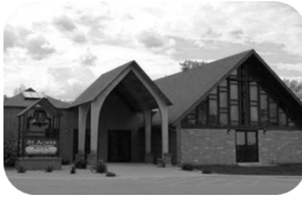
St. Agnes, Walker 210 Division Street

We welcome newcomers! Please contact our Parish Office to register.