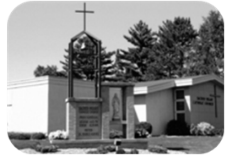
Sacred Heart, Hackensack 300 First Street North

Tuesdays at 8:30a to Wednesdays at 3:00p (except 1:00a to 5:00a)